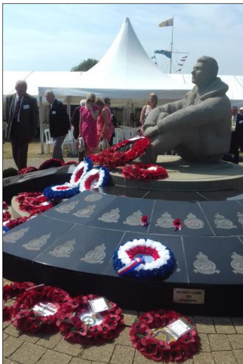
The Battle of Britain Memorial to The Few