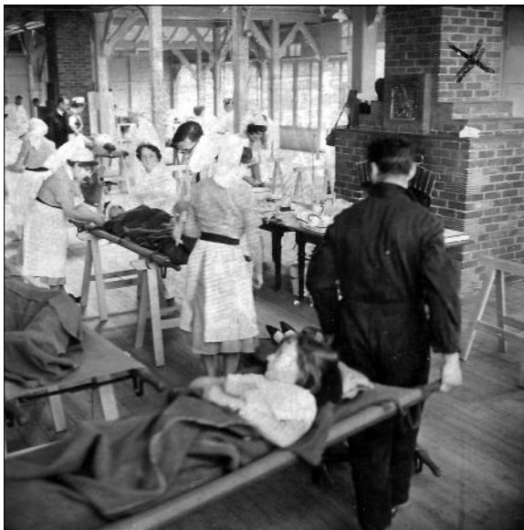
The improvised treatment area of the Forward Medical Aid Unit (FMAU). The location is probably Sandown Park Race Course

Ambulances were not being used to the best advantage. The peace time vehicles should have been used for sitting cases and the C. D. Ambulances for stretcher cases. This would have resulted in more casualties being lifted with the same number of ambulances.