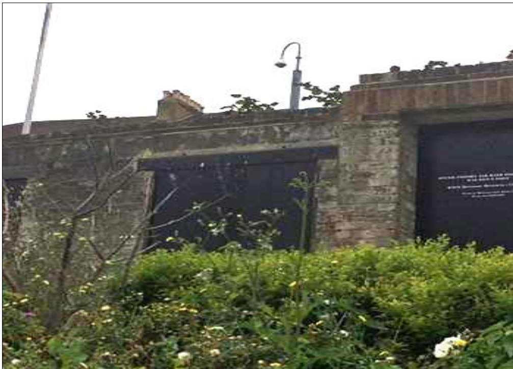
WW2 ARP Warden's Post, Dover, see pages 3 & 13.