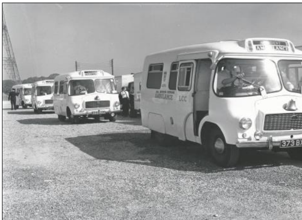
London County Council Ambulances in convoy

Personnel were to report to their respective stations between 08.45 and 09.00hrs. Most volunteers arrived in good time despite the early hour, however some volunteers who had previously indicated that they would attend failed to do so and did not inform us of their change of plan. This always leads to complications