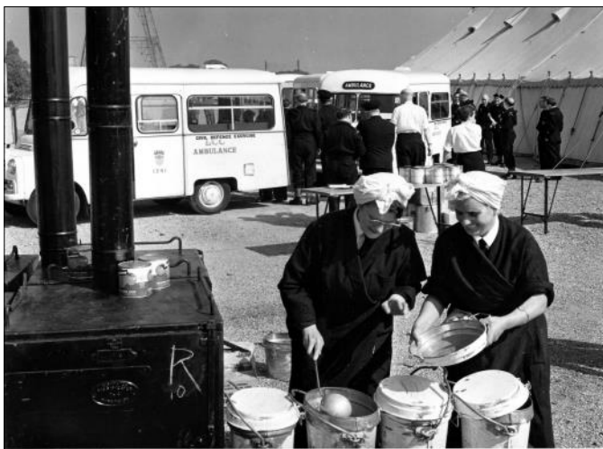
Members of the C D Welfare Section preparing meals utilising emergency feeding equipment

The food was prepared and cooked by members of the Welfare Sections of Areas 53A and 53F. Not only had they to feed the Ambulance Column at the Crystal Palace, but food had to be sent from there in insulated containers to four other sites.