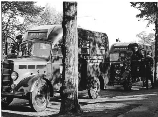
Civil Defence Ambulance Column

The principal object was to test the functioning of a Forward Medical Aid Unit under pressure, being a combined effort on the part of the Divisions of Battersea, Camberwell, Croydon, the County of London, Southwark, Wandsworth and Lambeth, with 1,200 civil defence personnel participating during Sunday 5 September. Some 800 "casualties" were transported from the Crystal Palace to the Forward Medical Aid Unit at the Sandown Park